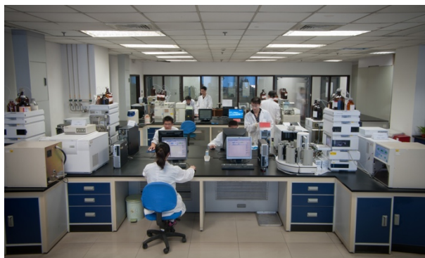
Open access lab